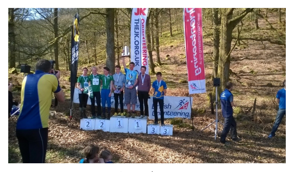
Men's Short Relay JK 201 (1st Sarum, 2nd Devon)